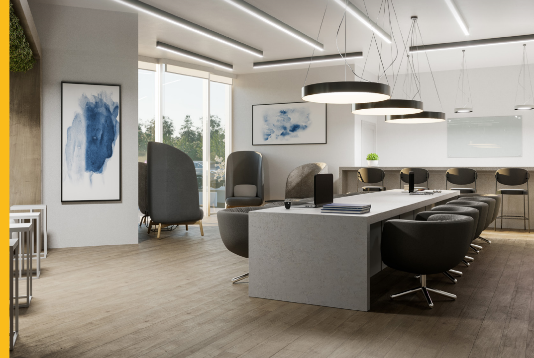
BUILDING A WORK STUDY LOUNGE